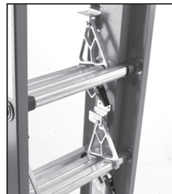
2 sets of durable, pivoting rung locks