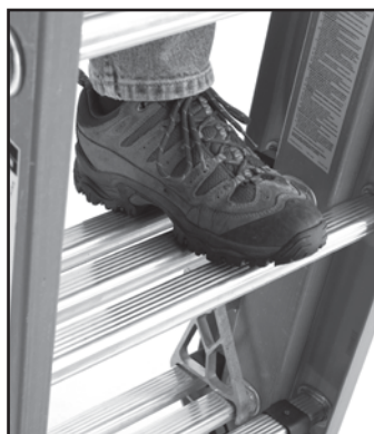
Comfortable standing surface