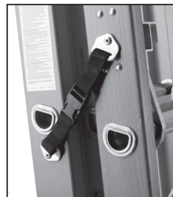
Retainer strap secures ladder for storage & transport