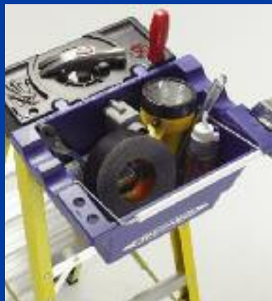
HolsterTop® with the new Lock-in Accessory System