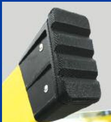
New oversized, molded PROGUARD BOOTS™