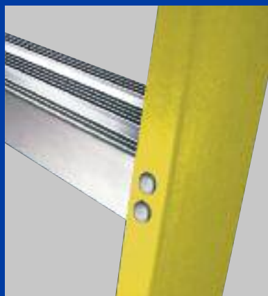
Slip-resistant Traction-Tred® steps