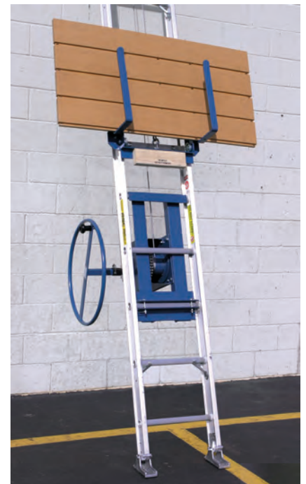
200 lb. HandiHoist w/ Truss Carrier

Replacement track sections and top brackets are the same as those used on standard PRO and Classic Platform Hoists.