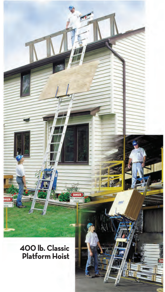
400 lb. Classic Platform Hoist