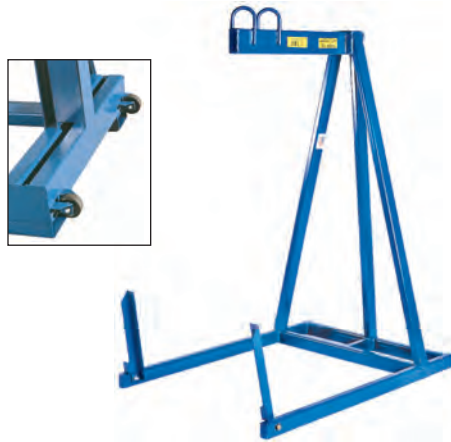
HF2000 Hoist Fork & Wheel Assembly