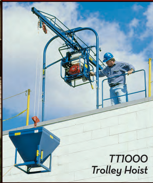
TT1000 Trolley Hoist