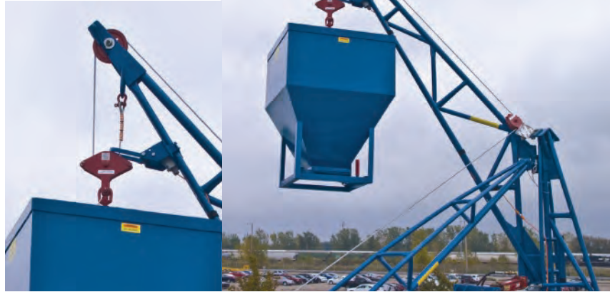
HS2000 Swing Hoist with Optional Upper Limit Switch