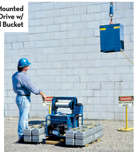
Ground-Mounted HH500 Power Drive w/ GB400 Gravel Bucket