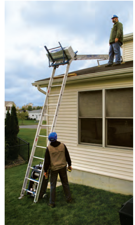
400 lb. Pivoting Platform Hoist