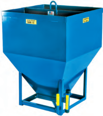
GB1600 Gravel Bucket