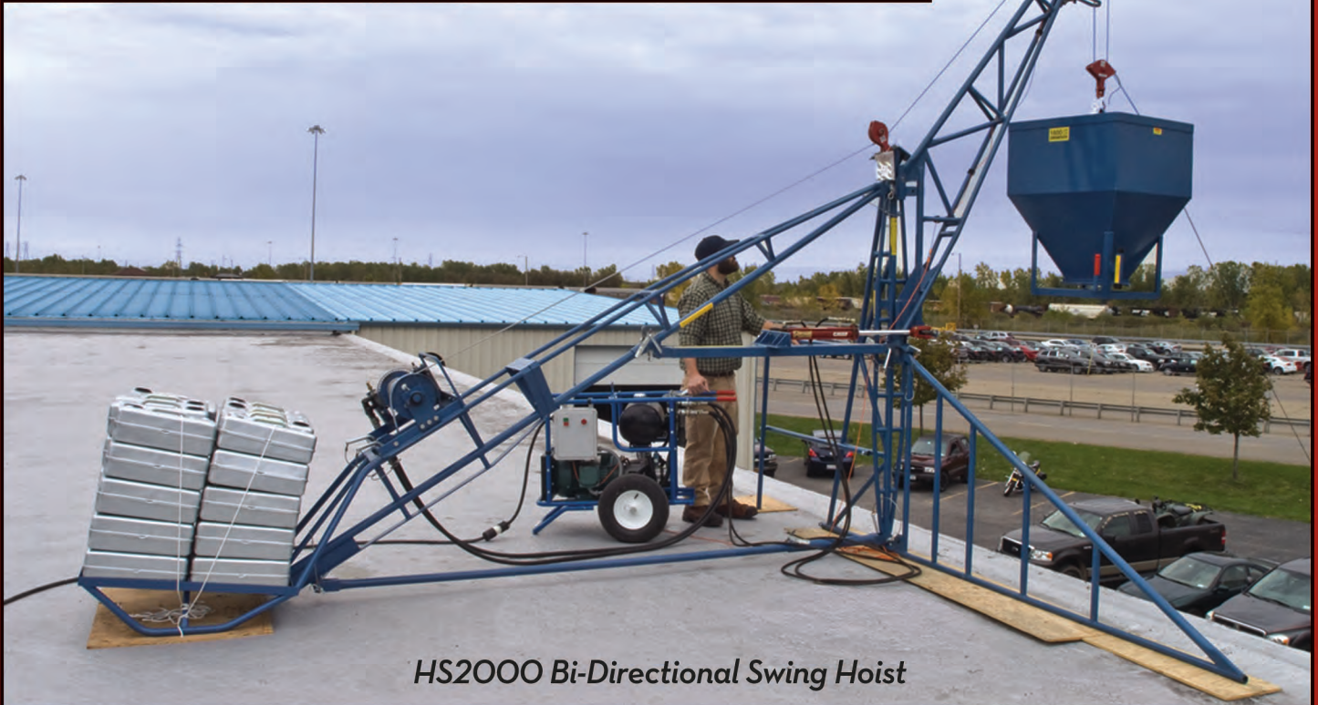
HS2000 Bi-Directional Swing Hoist