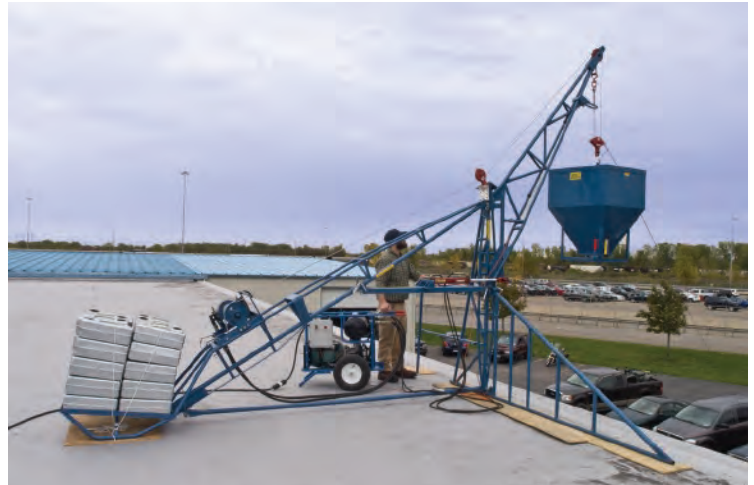
HS2000 Bi-Directional Swing Hoist w/ GB1600 Gravel Bucket