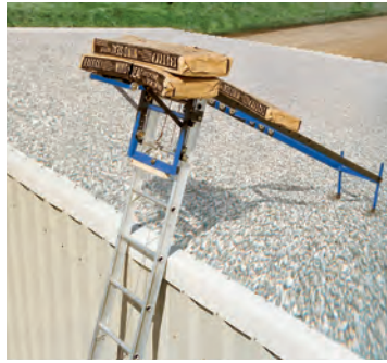
Roller Angle Guide - 400 lbs.