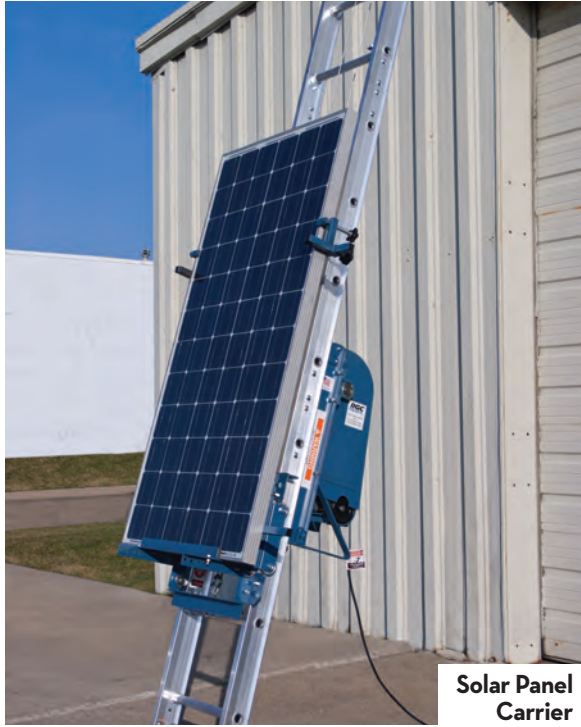
Solar Panel Carrier