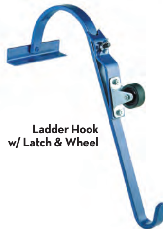
Ladder Hook w/ Latch & Wheel