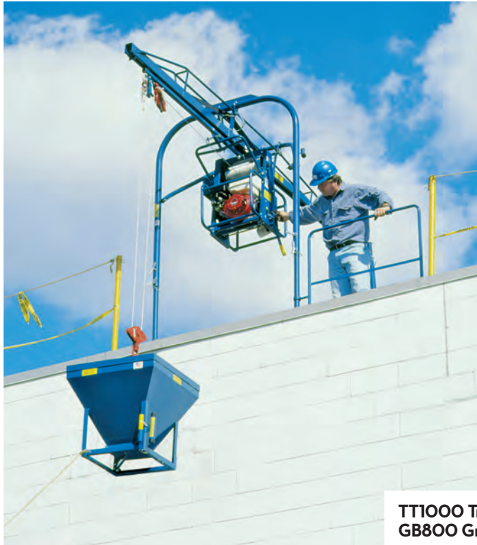
TT1000 Trolley Hoist w/ GB800 Gravel Bucket