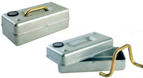
Ballast Weight Shells (Assembled & Unassembled)