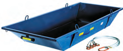
1200 lb. Trash Tray