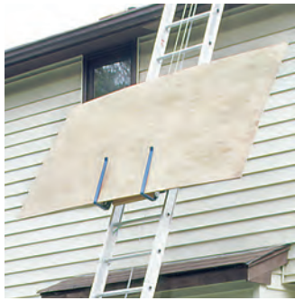
Plywood Carrier - 400 lbs.