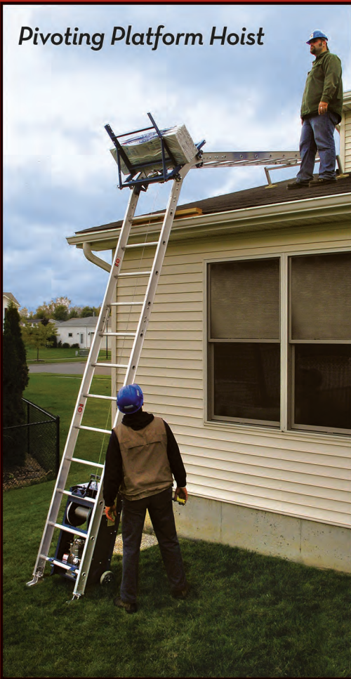
Pivoting Platform Hoist