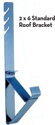
2 x 6 Standard Roof Bracket

*Long Brackets available on special order. 25 dozen minimum order.