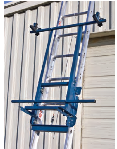
Solar Panel Carrier (without Panel)