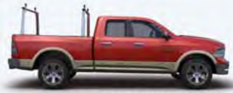
RAM PICKUP TRUCK