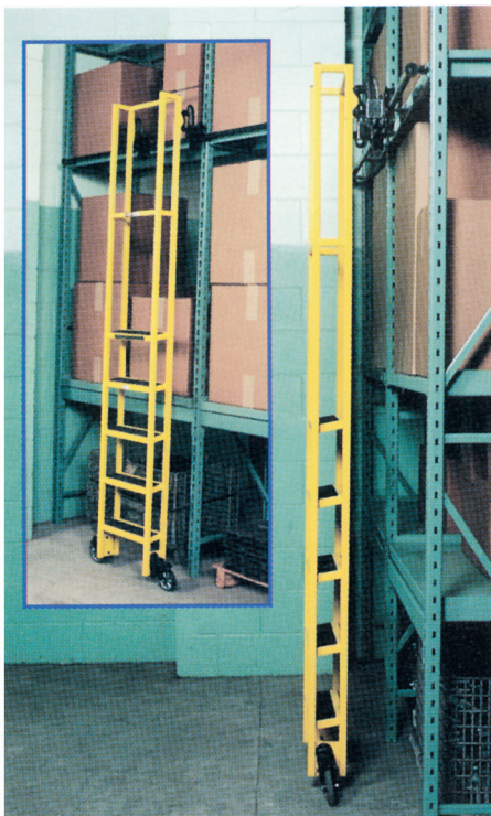
When not in use a unique design feature allows the ladder to store tight against the shelf for more aisle space.