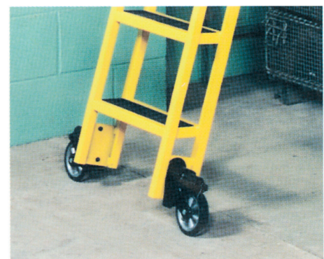
The bottom wheel brake prevents movement while in use.

Division of Material Control, Inc. www.cotterman.com • info@cotterman.com