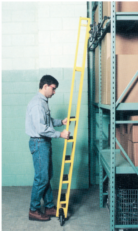
The Single Trak ladder pulls out to an 80 degree climbing angle.