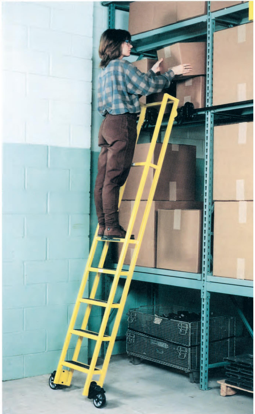
Single Trak Series 7180 is so simple to use and store, it is fast becoming one of the most popular ladders for access to vertical shelf storage.