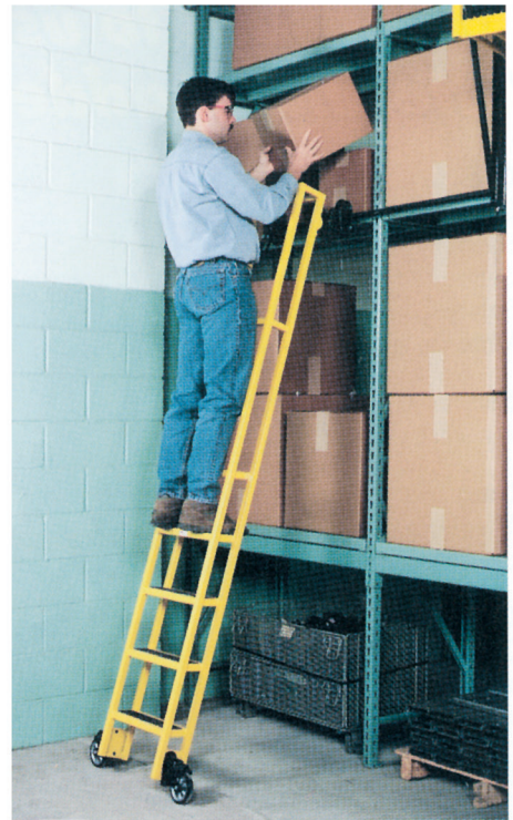
For fast, easy access to vertical shelving.