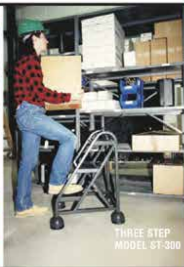
THREE STEP MODEL ST-300