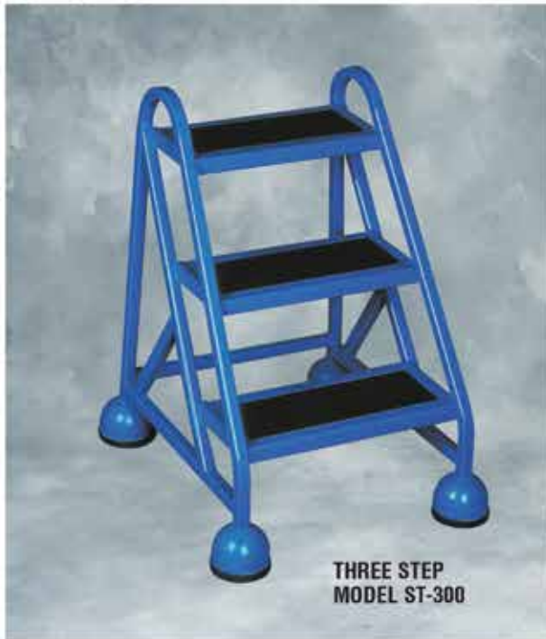
THREE STEP MODEL ST-300