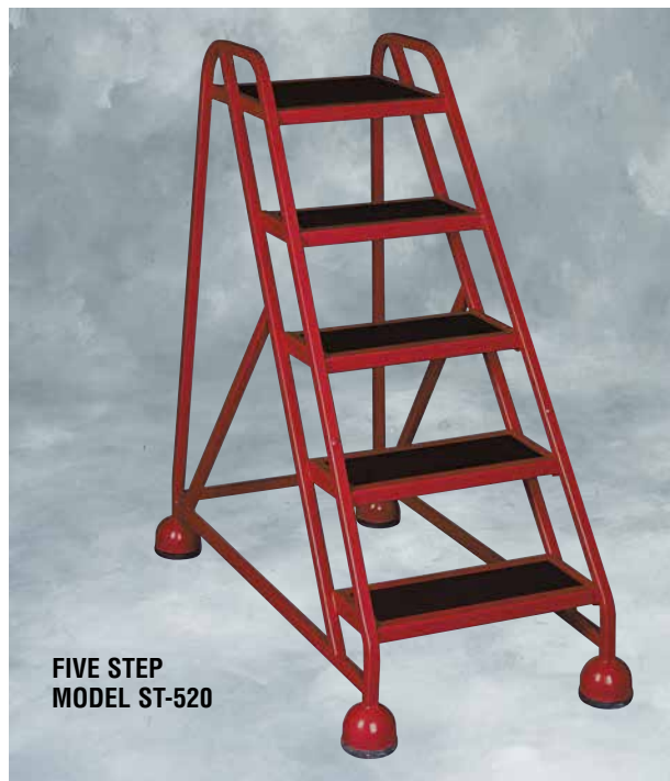
FIVE STEP MODEL ST-520