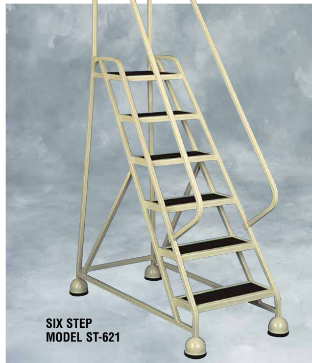
SIX STEP MODEL ST-621