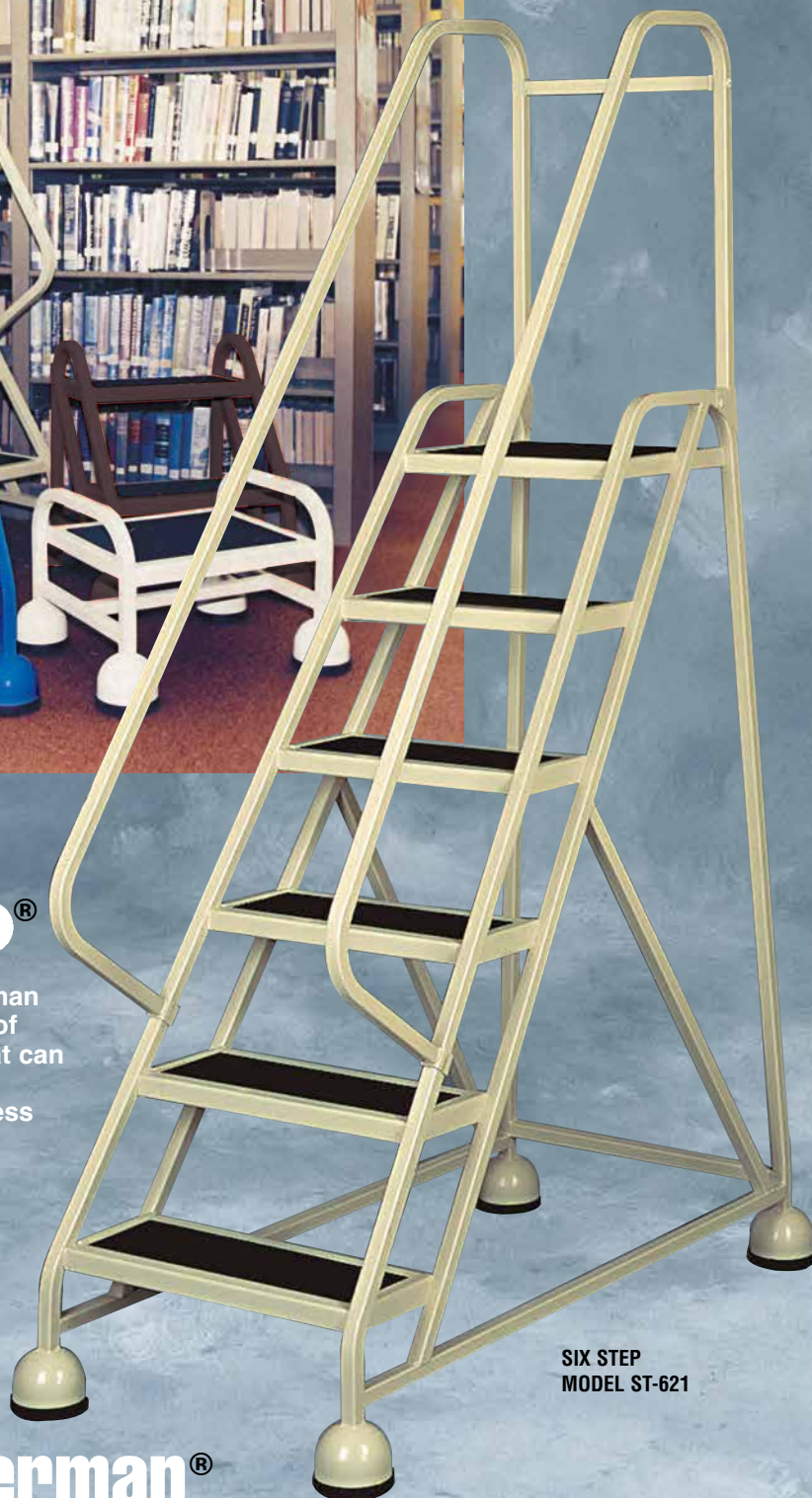
SIX STEP MODEL ST-621

A CONVENIENT FILING SHELF AND FULL HANDRAILS ARE AVAILABLE