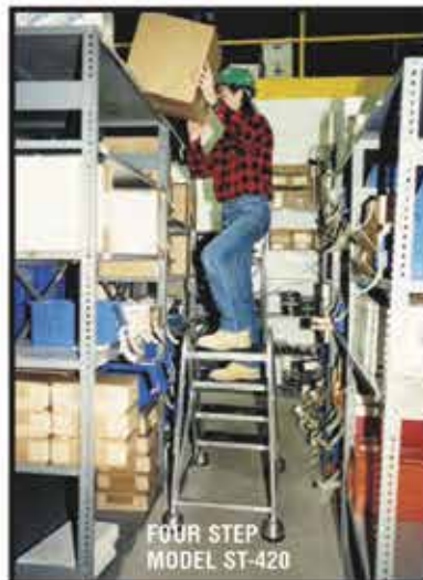
FOUR STEP MODEL ST-420