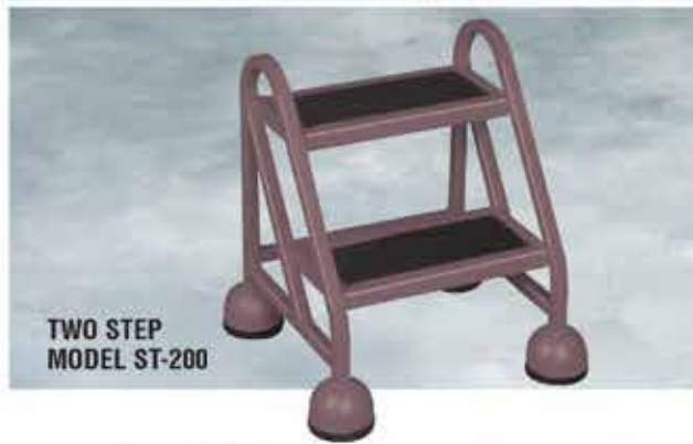
TWO STEP MODEL ST-200