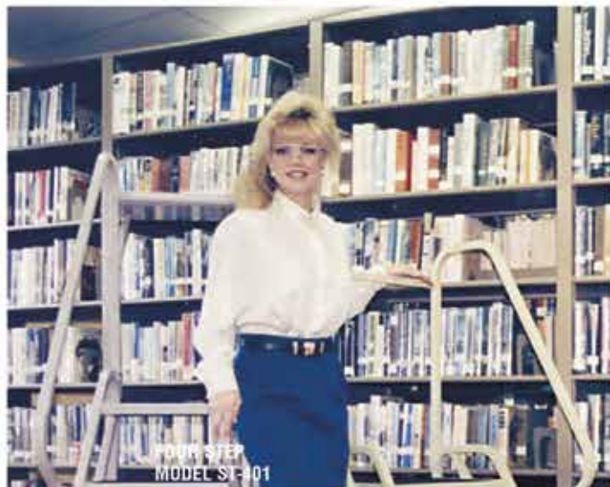
FOUR STEP MODEL ST-401