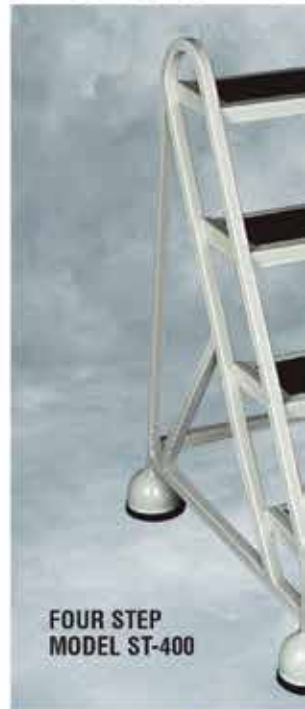
FOUR STEP MODEL ST-400