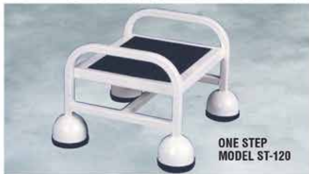
ONE STEP MODEL ST-120