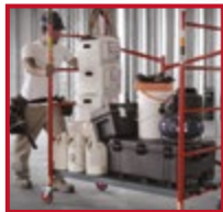
TRANSPORT 1,000 LB (454 KG) CAPACITY