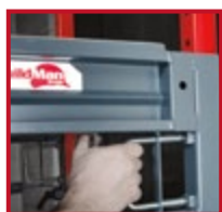
QUICK AND EASY HEIGHT ADJUSTMENT