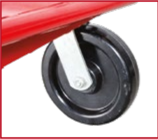
PHENOLIC CASTER LIGHTWEIGHT, PERFECT FOR CARRYING HEAVY LOADS, RESISTANT TO GREASE, OIL AND CHEMICALS.