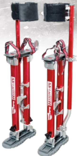
CONTACT GRIP ONE PIECE RUBBER OUTSOLE