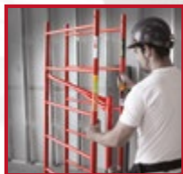
FOLDS FLAT FOR COMPACT STORAGE AND TRANSPORT