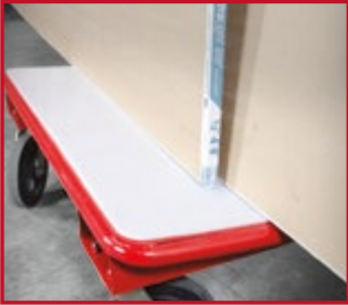
SLIDING COATING PROTECTS THE SURFACE AGAINST ABRASION.