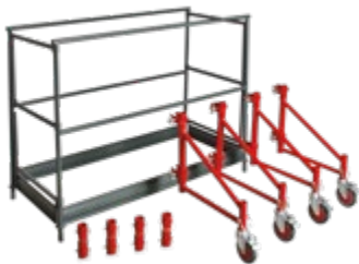
GUARDRAILS AND OUTRIGGERS COMPLETE SYSTEM MODEL: I-BM6SK UPC: 778300100361