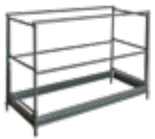
GUARDRAILS SYSTEM MODEL: I-BM6GR UPC: 778300100491