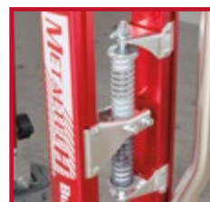
DUAL SPRING ACTION