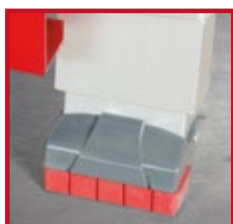
ANTI-SLIP HEAVY-DUTY FOOTING