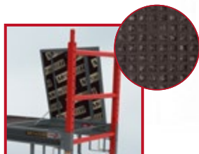
SAFECLIMB TRAPDOOR AND ANTI-SLIP DECK