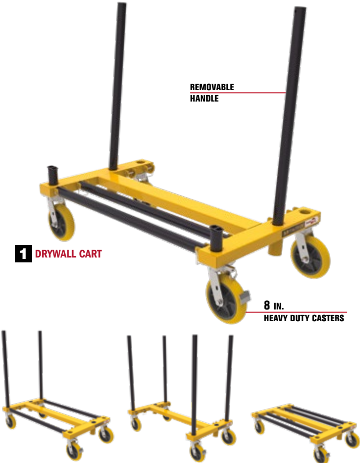
1 DRYWALL CART