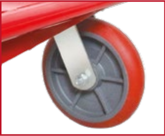
POLYURETHANE CASTER SHOCK-ABSORBING, NON-MARKING AND SUPERIOR IMPACT RESISTANCE.