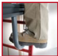
SAFECLIMB RUNG STEP