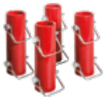
SET OF 4 COUPLING PINS MODEL: I-BM6C4 UPC: 778300100538