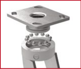
KINGPINLESS SWIVEL DESIGN HIGH IMPACT RESISTANCE TO ABUSE AND BETTER PERFORMANCE.