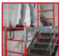
TIGHTENING HANDLE FOR MORE STABILITY