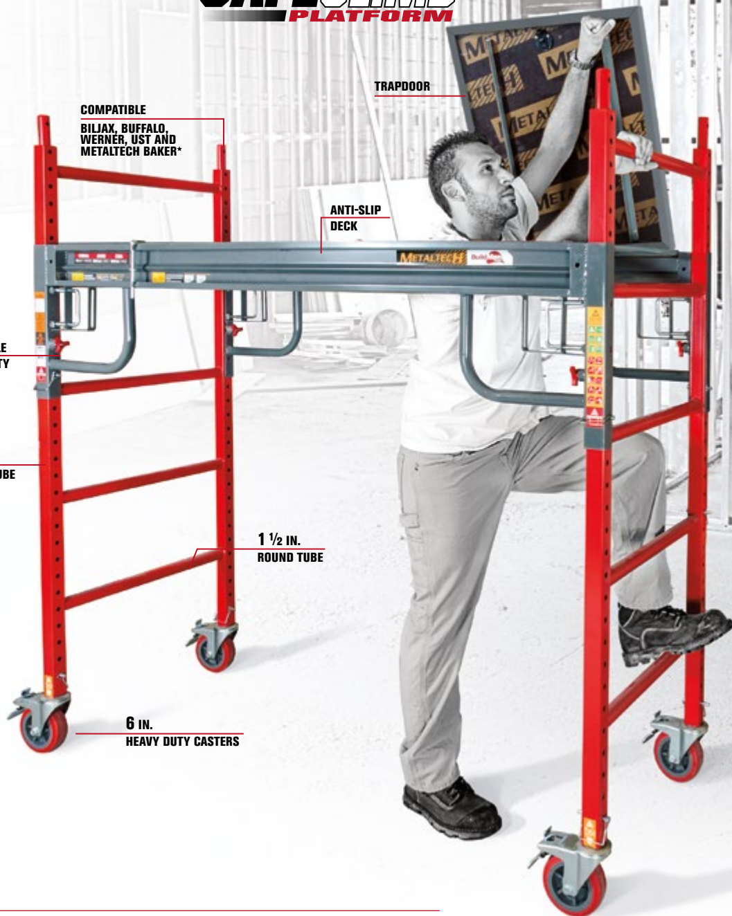
COMPATIBLE BILJAX, BUFFALO, WERNER, UST AND METALTECH BAKER*