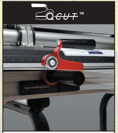
Mounts on track to quickly and easily cut material.