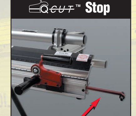
Allows Q-Cutter to remain installed on the track without interfering with bending. Simply slide Q-Cutter back to stop. Quick release allows for easy removal for transport.